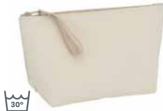
Ecrù/Natural ES003082 (recycled polyester from plastic bottles)