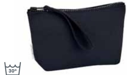
Nero/Black ES003078 (recycled polyester from plastic bottles)