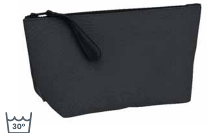
Nero/Black ES003079 (recycled polyester from plastic bottles)