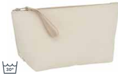
Ecrù/Natural ES003083 (recycled polyester from plastic bottles)