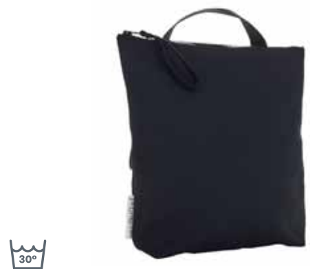
Nero/Black ES003080 (recycled polyester from plastic bottles)