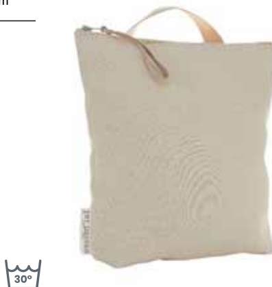
Ecrù/Natural ES003084 (recycled polyester from plastic bottles)